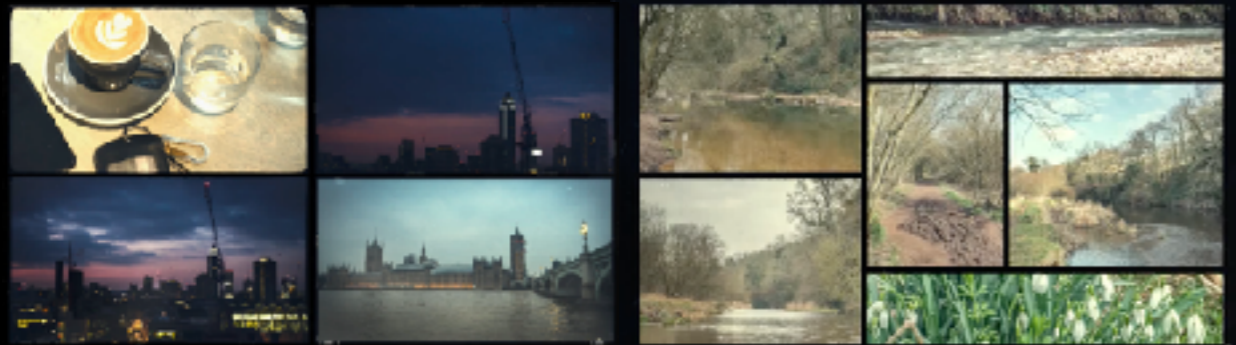
Street / Urban / Landscape Night time / Montage